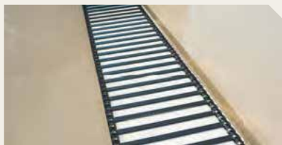
CAPACITY & COMMON SENSE More even flow comes from a stronger 88K chain with a slat every other link. Materials like the corrosion-proof poly floor and multiple layers of high-durability industrial coatings stand up to the toughest conditions.