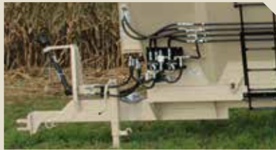
HYDRAULIC SYSTEM Heavy duty hydraulic system provides years of reliable operation.