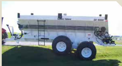
WALKING BEAM SUSPENSION Super-duty walking beam suspension helps absorb and distribute stress on the spreader when traveling rough terrain. This helps make operation easier and can add years to service life.