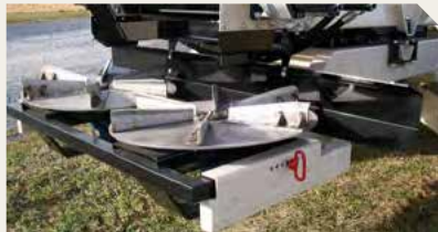
UNIQUE VERSATILITY BRINGS ADDED VALUE Easy to remove spinner attachment provides the flexibility to use the machine as a spreader or grain cart.